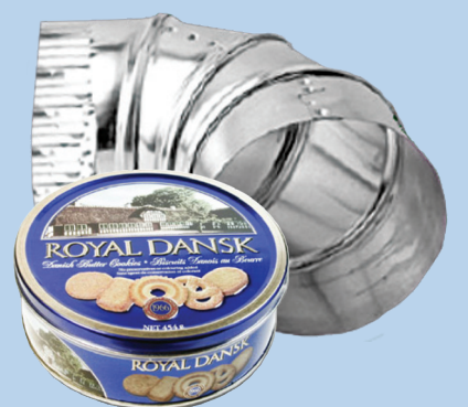
Scrap metal (less than 2 ft. x 2 ft. x 2 ft.)