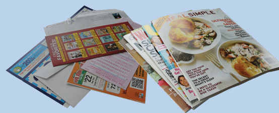
Mail, magazines, mixed paper