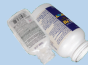
Pill bottles (no prescription vials)