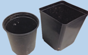
Plastic plant pots