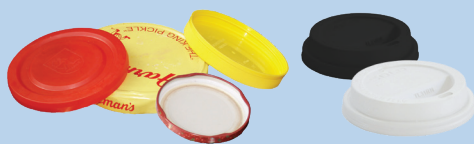
Lids (3 inches or wider)