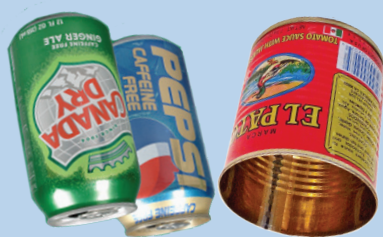
Aluminum & metal cans