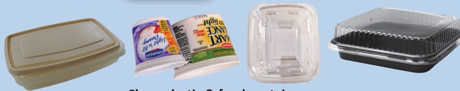
Clean plastic & food containers