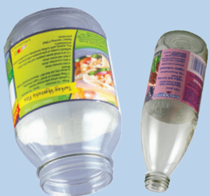
Bottles & jars