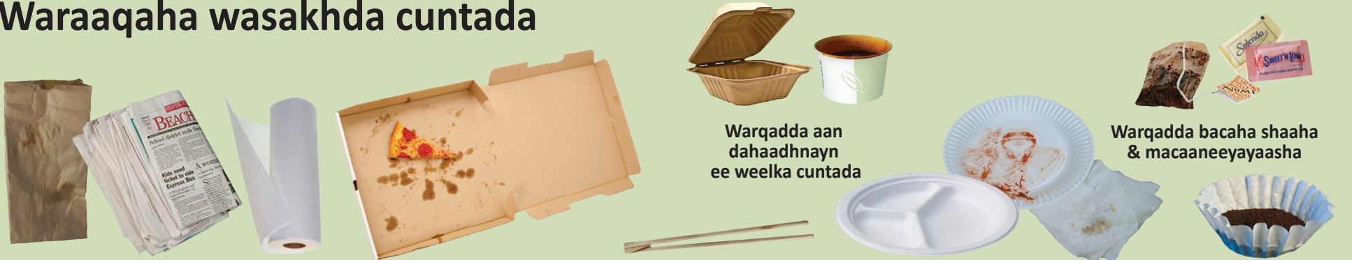
Bacaha waraqaha, wargeyska & tuwaalada waraqaha wasakhda cuntada