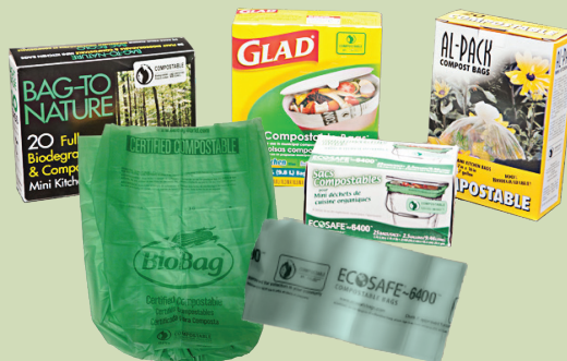
Bacaha la burburin karo ee la ansixiyay

Baagagani waxay u eg yihiin bac laakiin waxay ka samaysan yihiin dhir sidaa darteed way burburayaan.