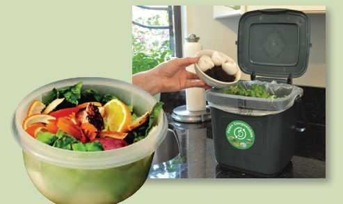
Tijaabada weelasha dib loo warshadayn karo

Baagagani waxay u eg yihiin bac laakiin waxay ka samaysan yihiin dhir sidaa darteed way burburayaan.