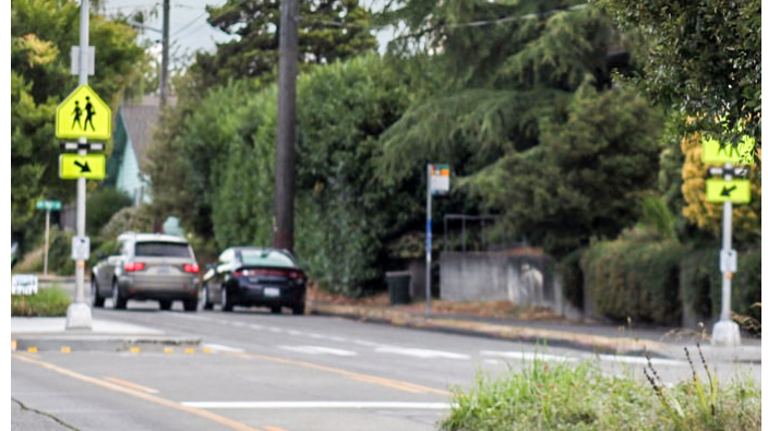
Example of Rectangular Rapid Flashing Beacons (RRFBs)