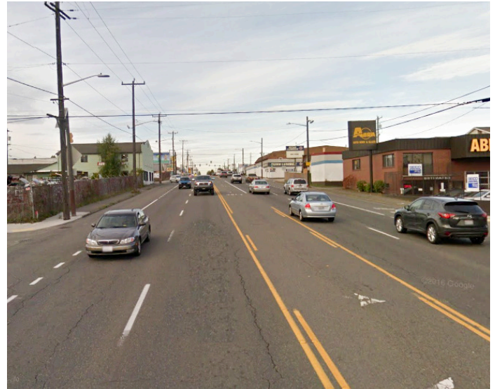
Looking north on Aurora Ave N (SR 99), near the intersection of N 92nd St