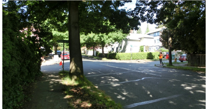
Looking West on 40th toward Bagley. Existing crossing flags shown on east side of intersection.