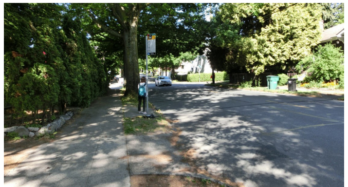
Looking West on 40th toward Bagley at eastbound bus stop.