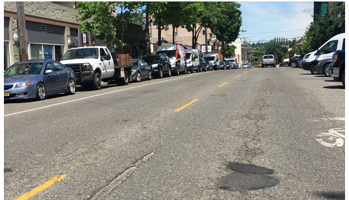
University Way NE is ready for repaving.

Approved by voters in 2015, the 9-year, $930 million Levy to Move Seattle provides funding to improve safety for all travelers, maintain our streets and bridges, and invest in reliable, affordable travel options for a growing city.