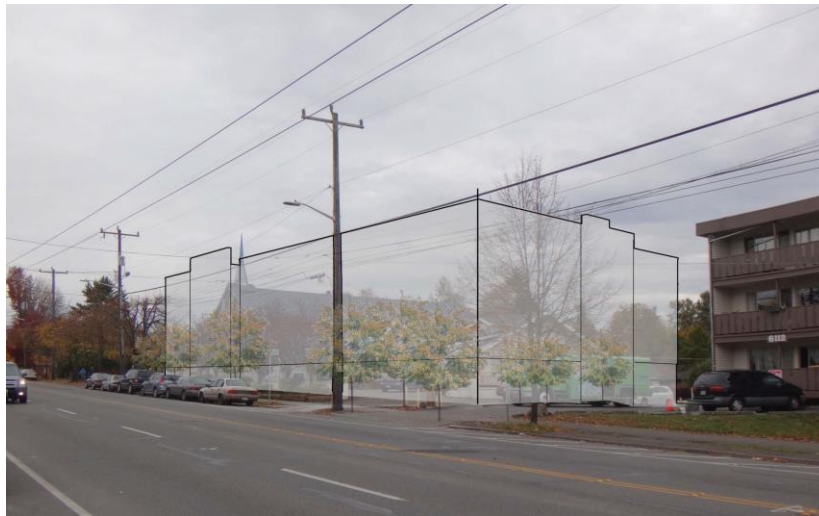
Exhibit 1 Existing Site w/Proposed Massing

On November 29, 2016, Washington Charter School Development, Inc. (WCSD) submitted a request for departure from one (1) Seattle Municipal Code (SMC) Development Standard to accommodate a new school operated by Green Dot Public Schools Washington State located at 6020 Rainier Ave S. (SDCI Project #3025697)