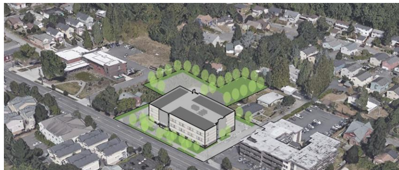
Exhibit 2 Proposed Site Plan