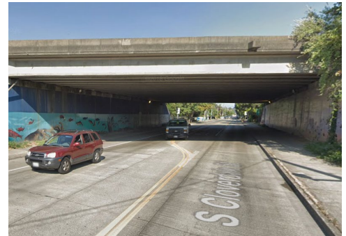
Shaqaalaha ayaa badeli doona layrarka hoose ee wadad 99 ee Gobalka Wadada South Cloverdale.